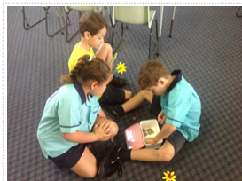
Maths in Action as we counted the donations.

How can we incorporate the Year of Grace into our lives this week? As you leave the house each day, or enter, reflect on the importance of that actual doorway to your life - who passes through it, what it means when family come home, or leave.