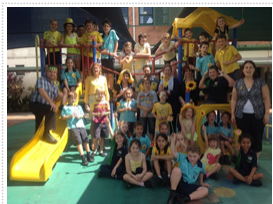
St Rita's celebrates!

$50 CAN HELP THE CANCER COUNCIL HELPLINE 13 11 20 PROVIDE FREE AND CONFIDENTIAL INFORMATION AND SUPPORT ON ALL ASPECTS OF CANCER.